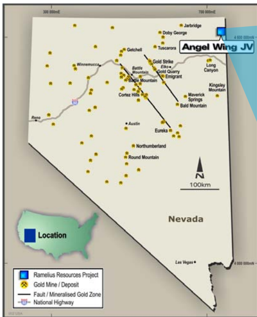
Figure 2: Angel Wing project location map

The Angel Wing project consists of 87 unpatented lode claims covering 7.3 sq km in northeast Elko County, Nevada (Figure 2). Project area stratigraphy from youngest to oldest is a) Tertiary felsic volcanic units, b) Tertiary conglomerate, and c) limestone, probably late Paleozoic or Triassic in age. Past work consisted of geologic mapping, soil and rock sampling, a gravity survey, and RC drilling. Gold values from 0.1 to 94 Au g/t in rock chips occur in an area about 2,042 m long and up to 914 m wide. High gold value rock-chip samples with 10 to 94 Au g/t occur in steeply dipping, quartz-calcite-adularia veins within the limestone. Rock samples of altered and quartz-calcite veinlet stockworked limestone and Tertiary conglomerate contain up to 1.530 Au g/t. Historic shallow vertical drilling targeted disseminated mineralisation and returned up to 1.643 Au g/t over 15.2 m in drill hole DC-7. Since 2010, Ramelius has completed IP/Resistivity, ground magnetic, and soil geochemical surveys, three core holes, and 17 RC holes.