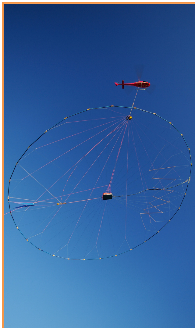
Figure 3: Fugro's HELITEM system in flight.

Combining the gravity data with good quality conductivity data over the target area will significantly improve the potential for drilling success.