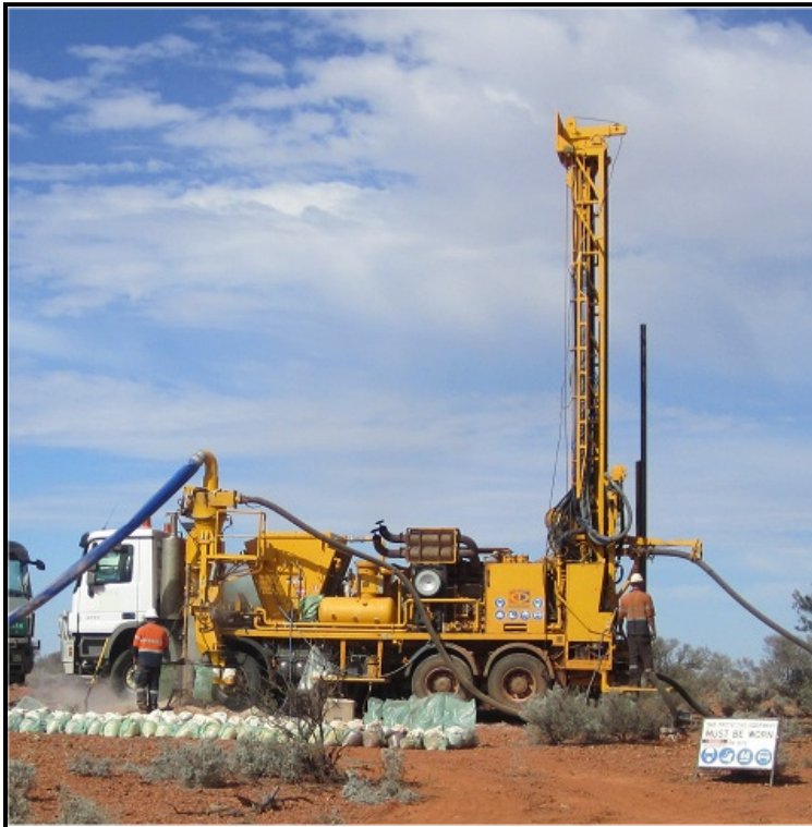
Figure 2: drill rig in operation at Durkin – Conductor 3 target zone.

The presence of mafic rocks bearing sulphides in these drill holes supports the geophysical modeling (Figure 1) completed at Conductor 3 that suggests a dense and magnetic body with an associated conductive response. The geophysical signatures observed are considered to represent a potential layered mafic - ultramafic body containing sulphide mineralisation. The depth and lateral extent of mineralisation is open in all directions.