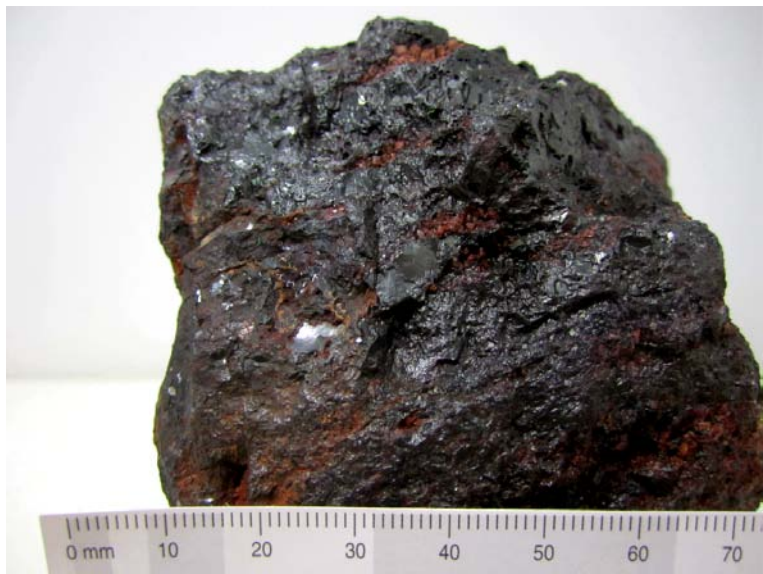
Figure 3: Outcrop sample containing massive iron mineralisation from outcrop located on Lake Anthony tenement. Niton XRF reading of this sample returns spot reading of 66% Fe.

Follow up outcrop mapping and systematic sampling of other interpreted iron outcrops within the project areas is planned. Low cost ground based gravity surveys designed to replace the existing historic 4 mile spaced data coverage and ground magnetic surveys also will be used to map any subsurface extension of the outcropping iron formations. These surveys will form part of a coordinated program planned for Marmota's projects in the region over the coming weeks.