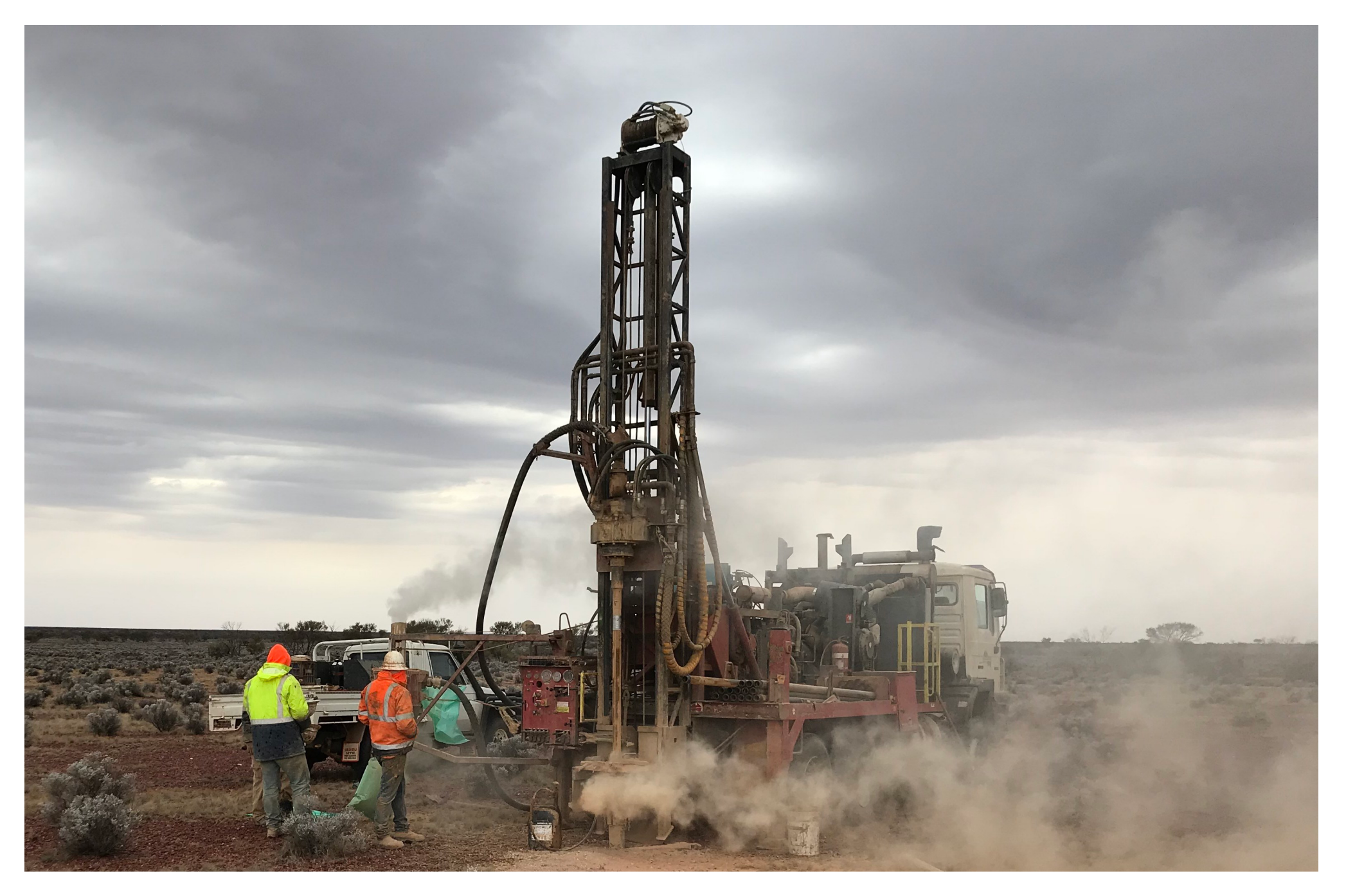
Figure 1: Drilling during program with McLeod Drilling AC rig