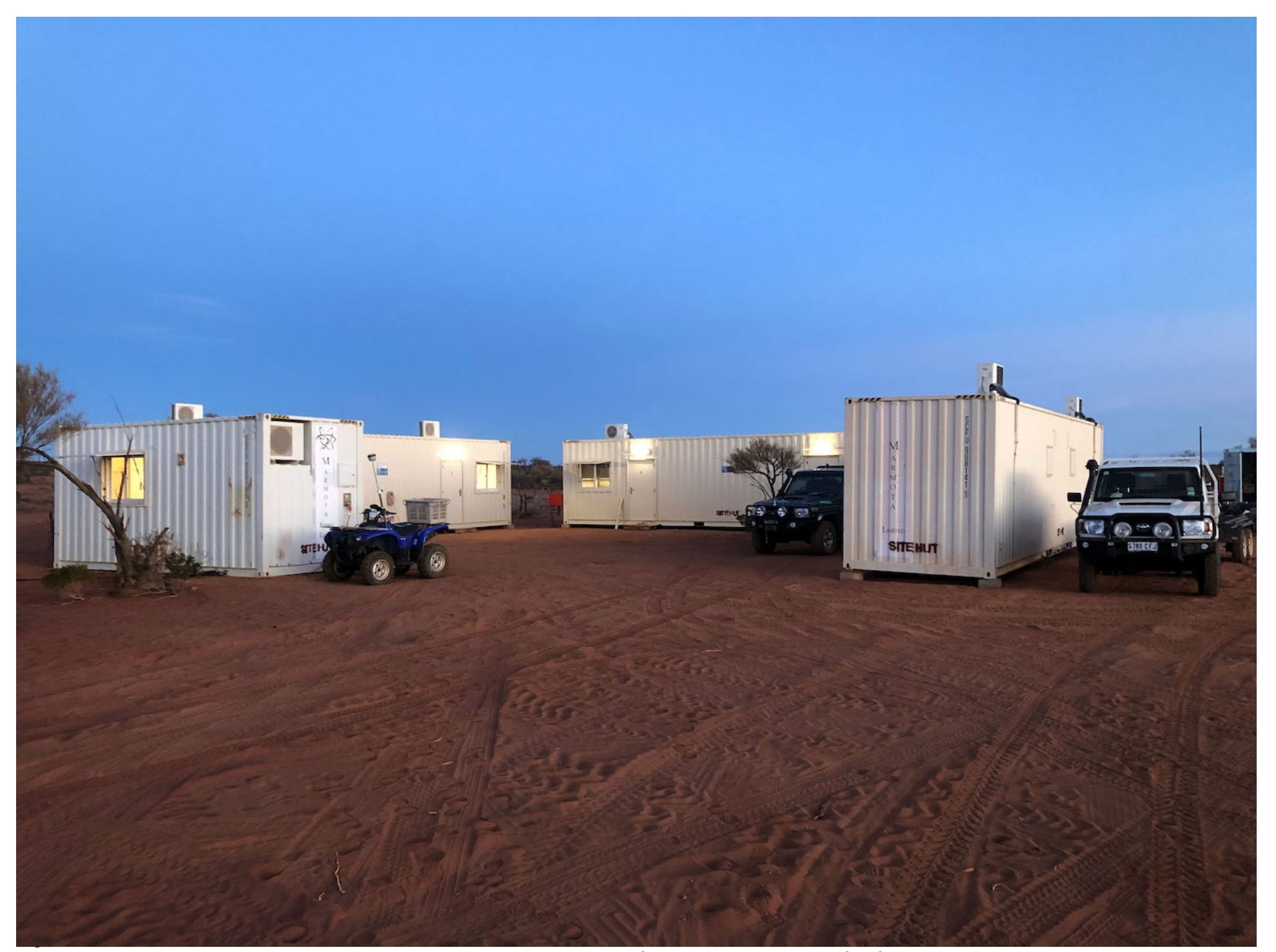
Figure 3: Aurora Tank - Camp starts to take shape