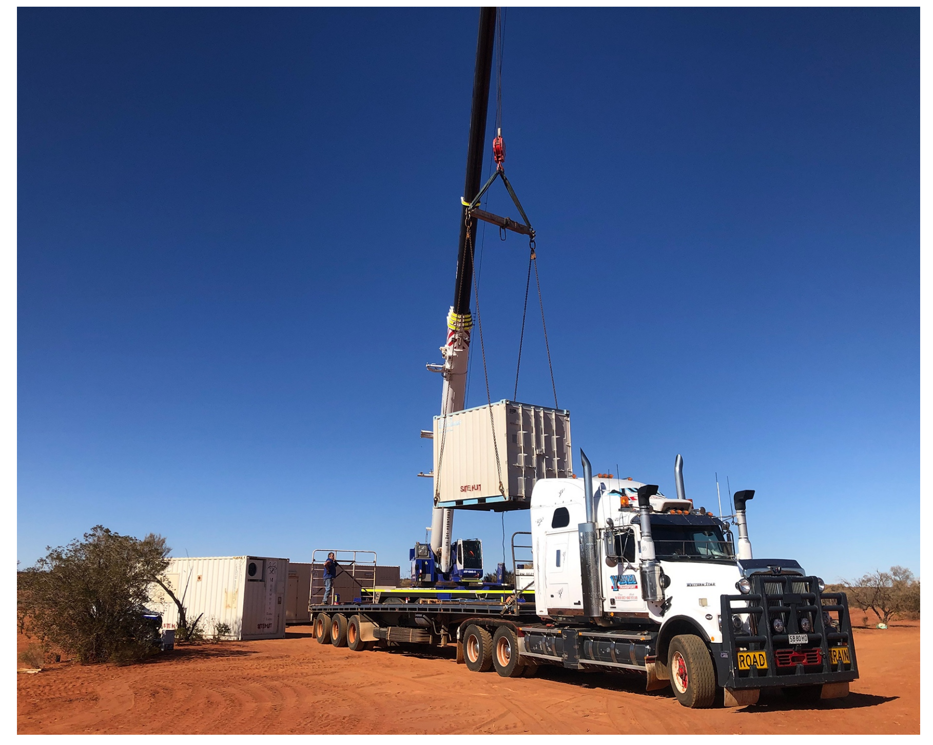
Figure 1: Components of camp being unloaded at Aurora Tank from road train