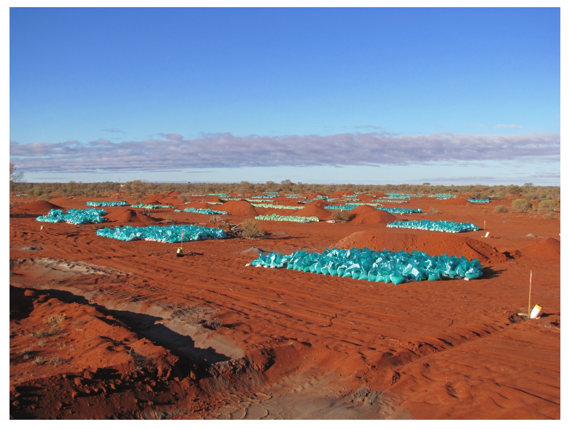
Figure 2: Aurora Tank: latest view from August 2020 drilling