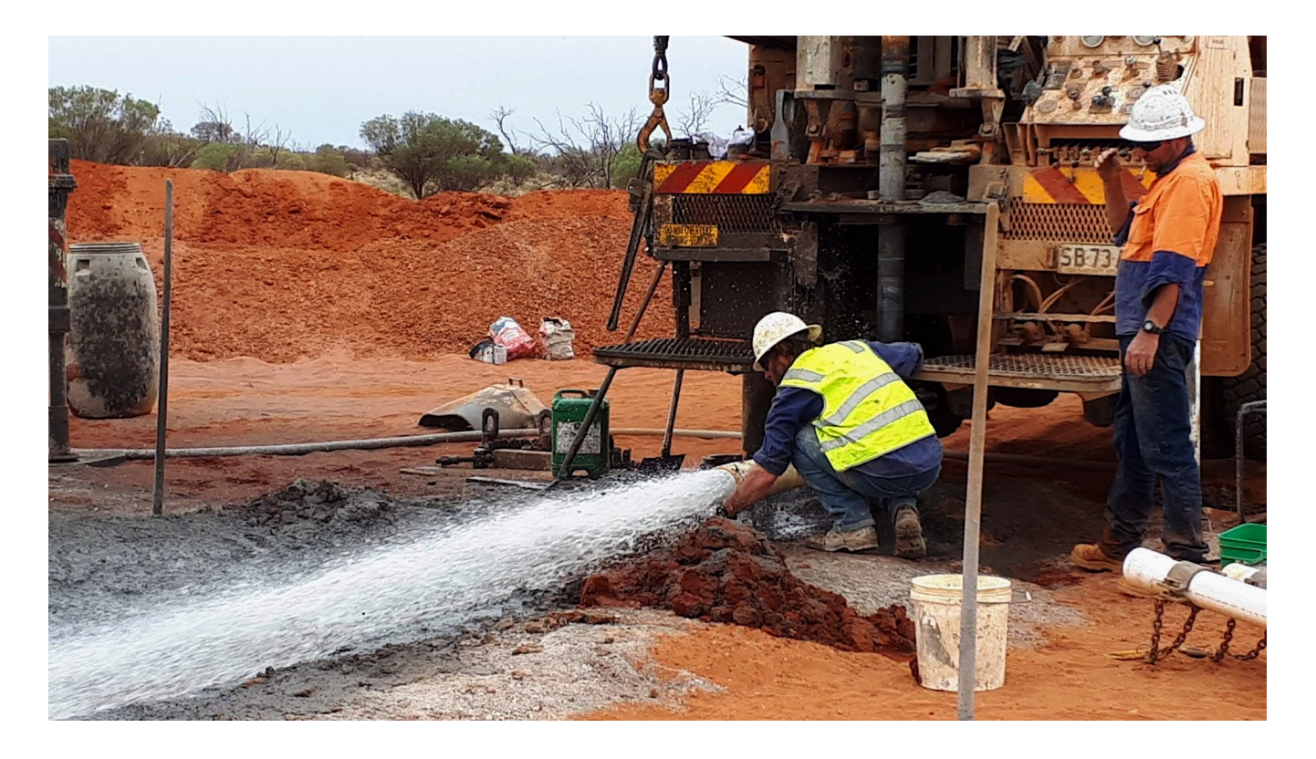
Fig. 2: Underground water gushes out from new Bore Hole 1 at Aurora Tank