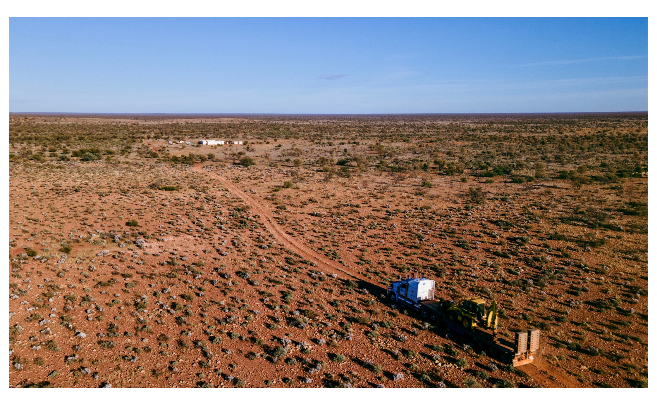
Fig 1: Newly acquired earth moving equipment arriving into Aurora Tank after 3,500km trip from Perth