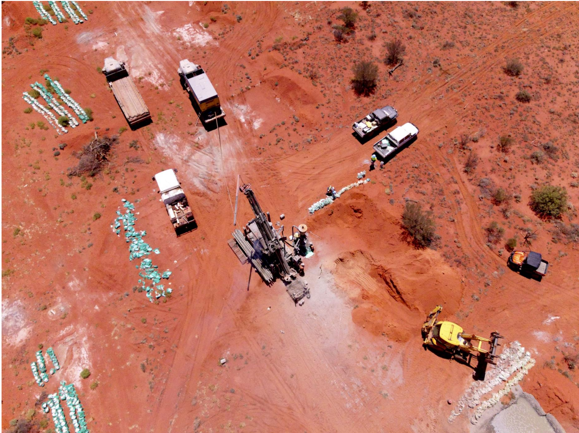
Figure 2: Drilling at Aurora Tank in February 2023