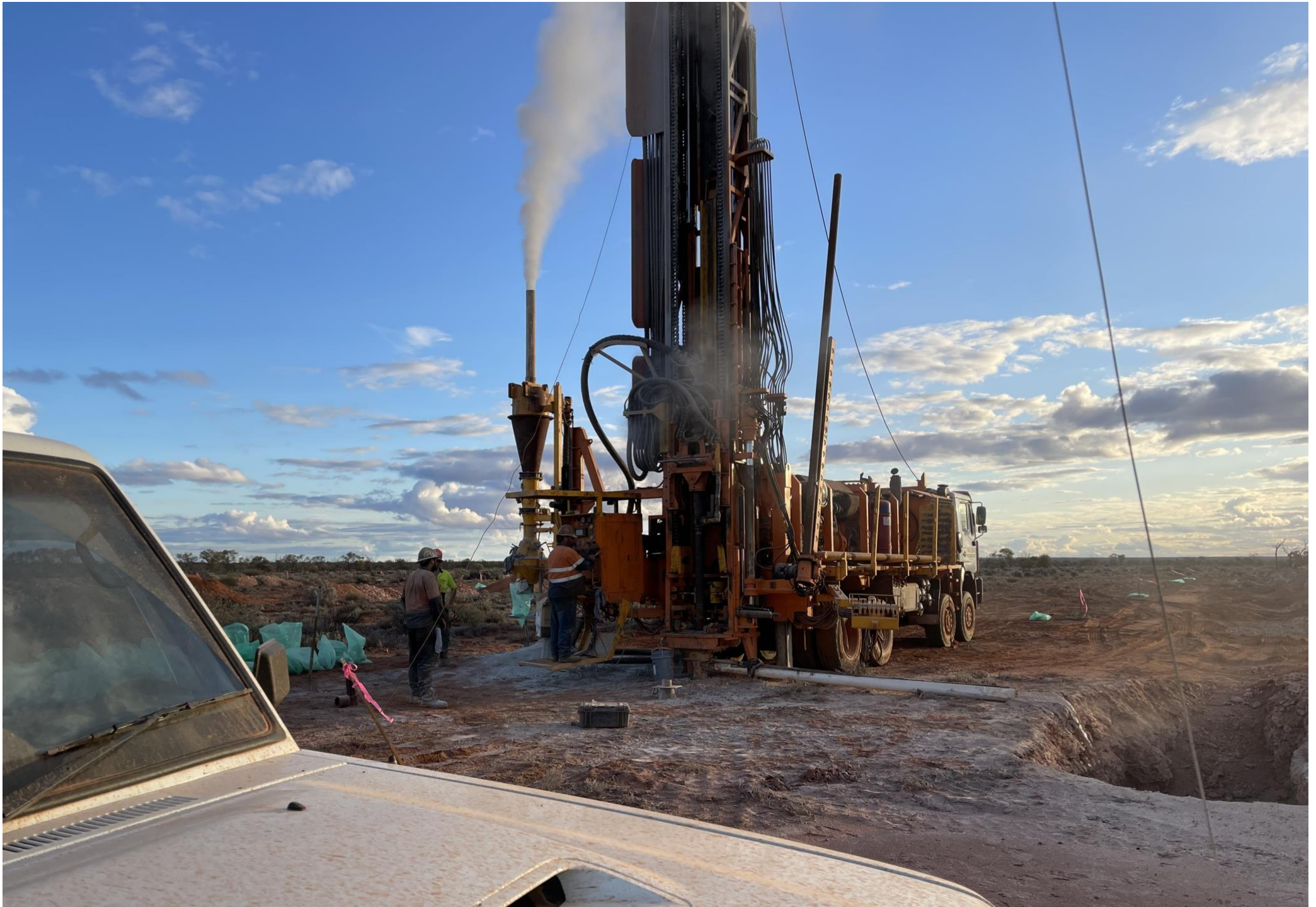
Figure 1: RC drilling commencing at Goolagong