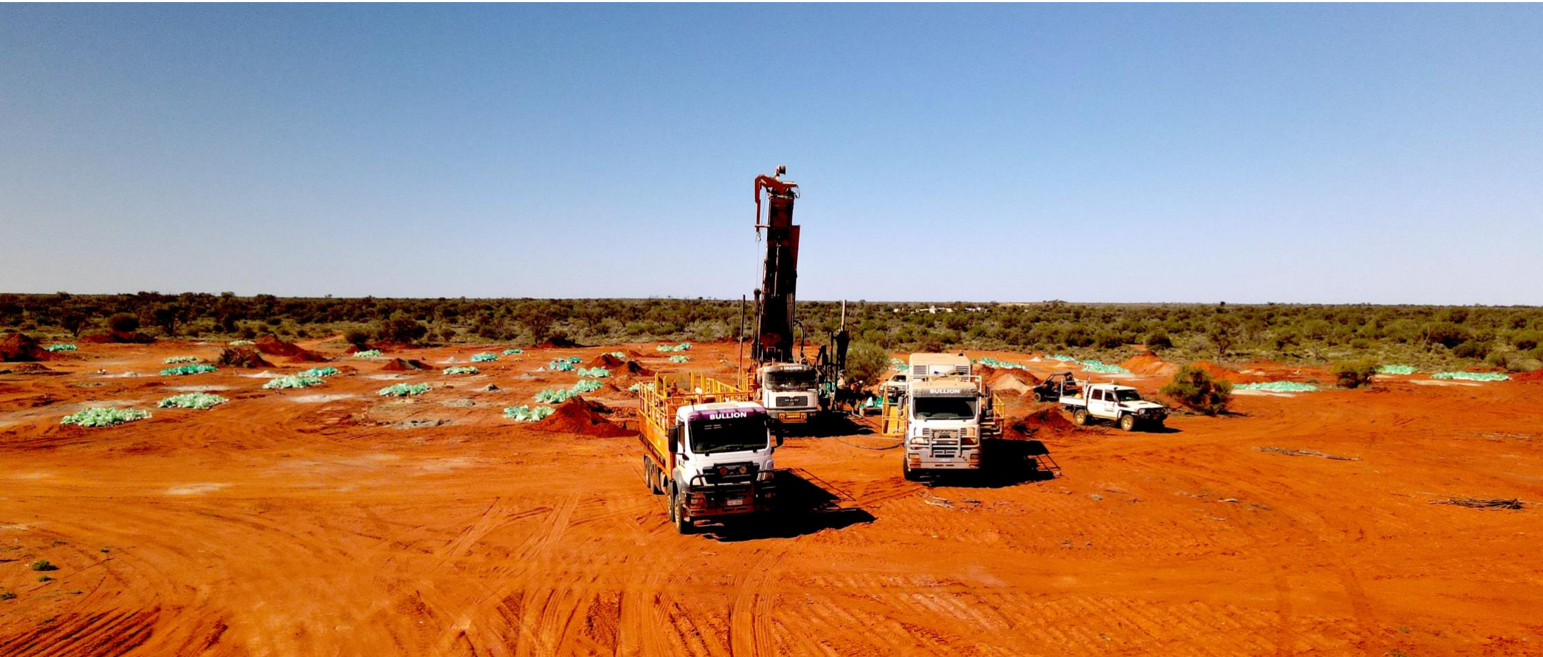
Figure 3: Aurora Tank drilling in August 2024